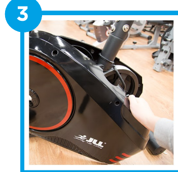
Remove either one or both sides of the casing