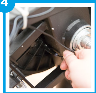
Locate the sensor on the left side of the bike