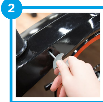
Using the multi tool remove all the screws