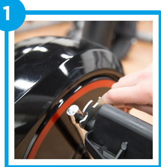
Start by removing the pedals