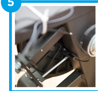
Remove the small screw from under the sensor